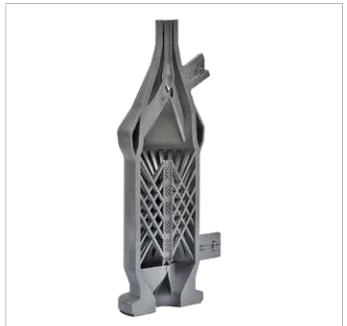
Fig. 1 Interior features built into one assembly within the extrusion tool

The extrusion tool, built in AlSi10Mg, is used to produce technical hoses with a diameter of 10 millimeters. The requirements of the component include substantial high-pressure durability for efficient production and a long tool life. Utilizing the benefits of selective laser melting, the tool integrates both flow-optimized construction and a reduced assembly, combining individual components into one. Static mixers that evenly distribute paint and additives, fins that rotate the melt, a thermocouple sensor mount and flange are integrated together, as well as an air feedthrough for the hose to prevent it from collapsing due to the surrounding pressure.