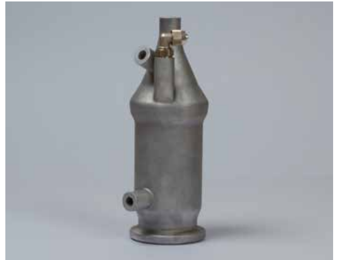
Fig. 2 Single-piece extrusion tool

Based on the CAD data created, additive manufacturing could begin. MonaLab GmbH built the tool on the SLM®280, which is not only suitable for serial production, but also for the manufacture of individual components.