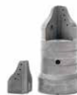
Fig. 7: Tool with internal cooling