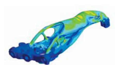
Fig. 3: FEM calculation