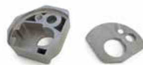
Fig. 8: Housing