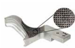
Fig. 5: Tong with structure adapted to the production process and loads