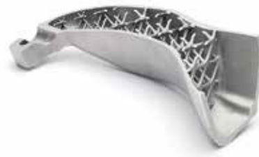
Fig. 2: Part structure with load-adapted supports