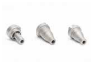
Fig. 6: Spray nozzles