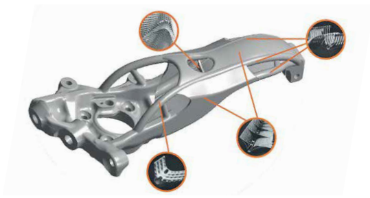
Fig. 1: Selection/assessment of design approaches

Tests carried out on tensile and notched bar specimens built in the same process showed results matching the forecast values.